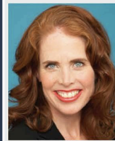
Meg Soper Communications